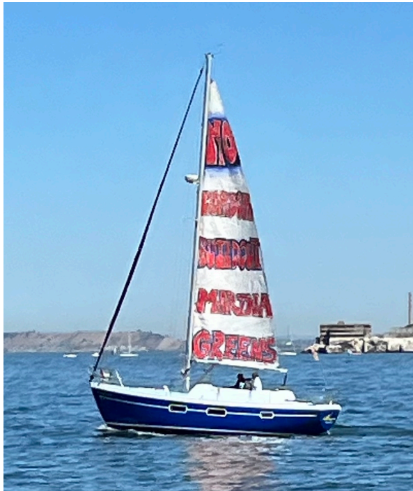
Joe Bravo's sailboat messages front

Their demonstrations, whether on land or water, precede a pivotal decision scheduled for October 19th when the San Francisco Recreation and Park Department Commissioners are set to cast their votes on the matter. In spite of mounting public feedback opposing the new harbor and numerous pleas for the Department to prioritize the repair and cleanup of existing harbors, the Department, under the leadership of Phil Ginsberg, appears determined to forge ahead with the unpopular proposal.